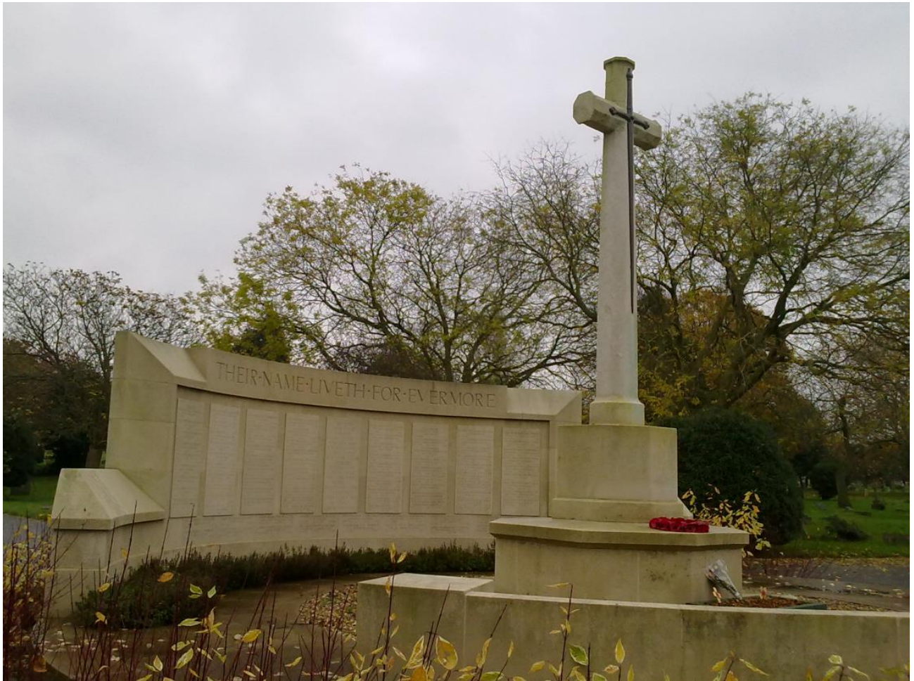
Cross of Sacrifice, Streatham Cemetery