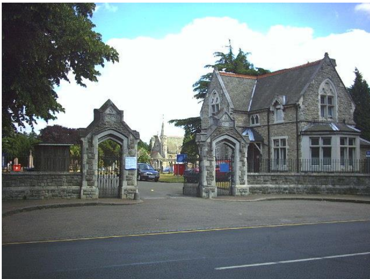
Streatham Cemetery