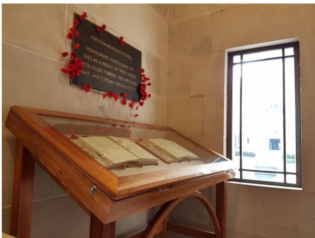
Commemorative Roll