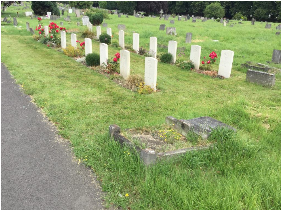
Streatham Cemetery